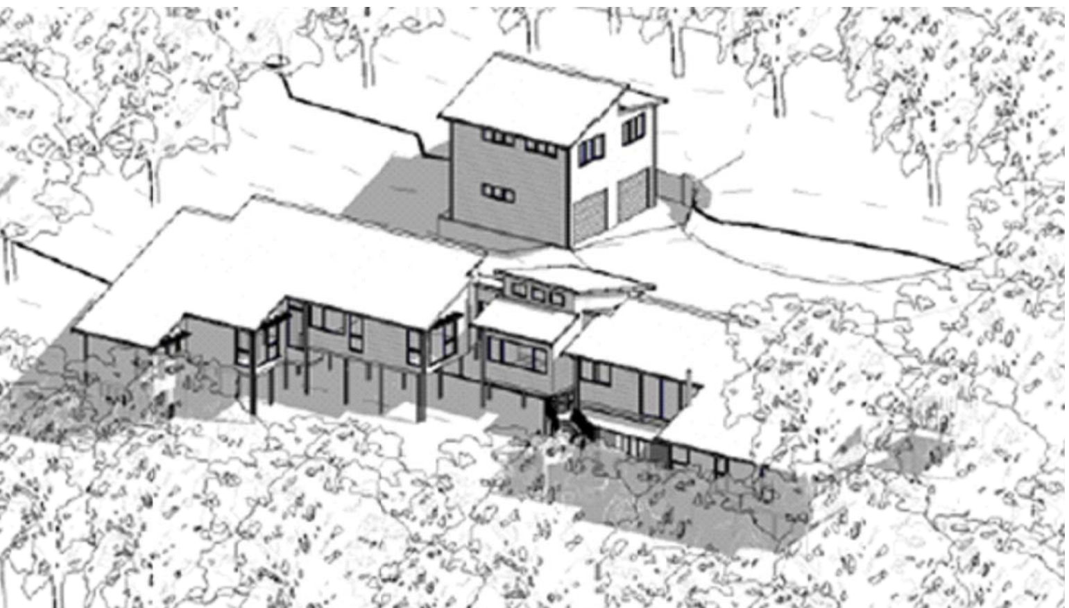
3D PERSPECTIVE VIEWS OF PROPOSAL